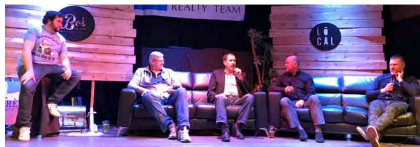
Mike Civik, Jamie Macoun, Colin Patterson and Brian McGrattan share stories at the Battle of Alberta in Red Deer.