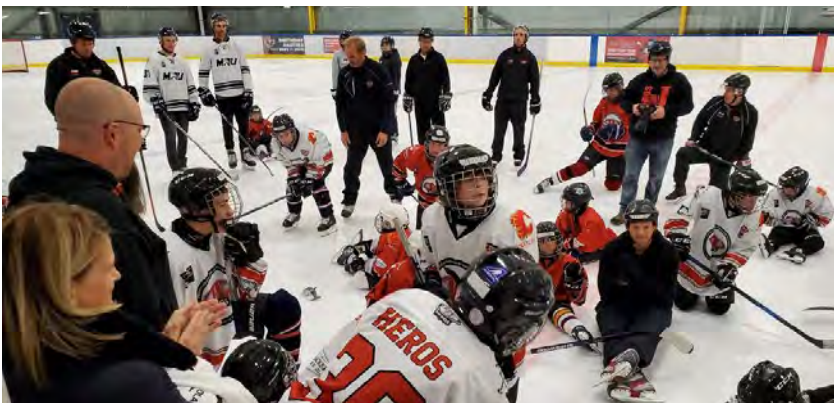
HEROS Hockey – hosting Super HEROS