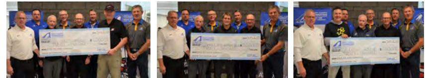
Cheques presented to Sport Central, Comrie's Sport Bank and KidSport Alberta.