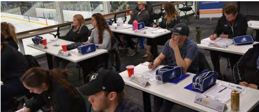
Future Leaders coaching development workshop in Red Deer.