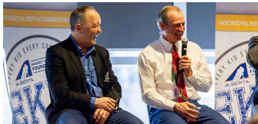
Brian Trottier and Brian Sutter reminisce in Lethbridge.

The event was held at Bo's Bar and Grill in Red Deer, and included a Hockey Hot Stove with NHL alumni Curtis Glencross, Jamie Macoun, Brian McGrattan and Colin Patterson, along with hourly draw prizes, grand prizes of tickets to see the Edmonton Oilers vs the Calgary Flames, and a Westjet raffle prize.