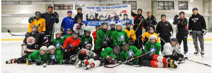
Rinks to Links – introducing kids to hockey.