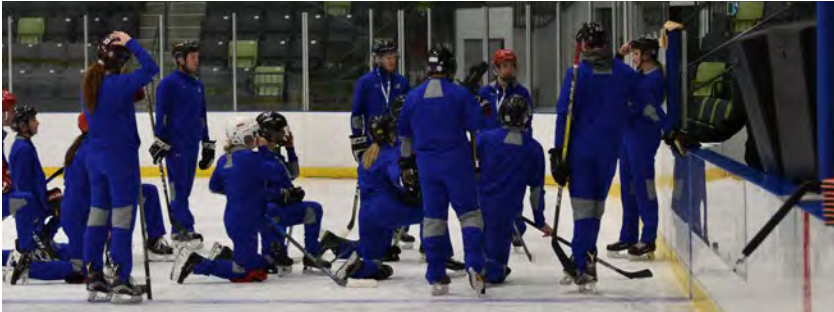
Future Leaders hosted in Red Deer.